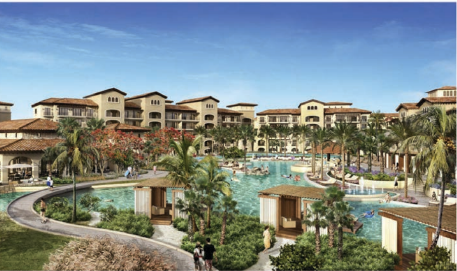
Grand Solmar at Rancho San Lucas

Located on the southern tip of Mexico's Baja California Peninsula, the neighbouring resort cities of San Jose del Cabo and Cabo San Lucas have long enticed travellers looking for a beach vacation. The destination's popularity breeds demand, and Los Cabos is in the middle of a resort boom. There are 13 new properties set to open over the next four years.